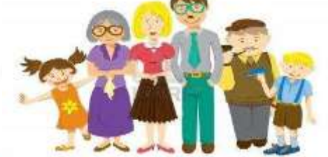
MY LOVING GRANDPARENTS