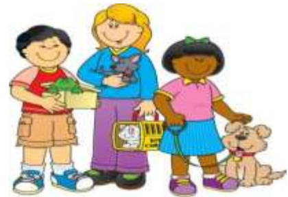
MY PETS....MY BUDDIES