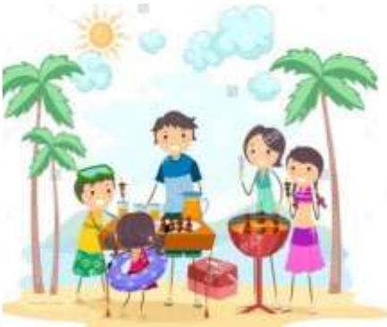
PICNIC WITH COUSINS